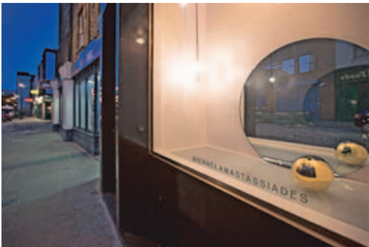
PARTIAL ECLIPSE The entrance to the house is also Mr. Anastassiades's shop-front, displaying work including a 'Ball' vase (£1,250) and a 'Waxing Gibbous' mirror, inspired by the moon's phases (£5,000, to order).