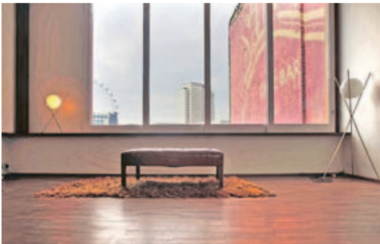
PICTURE WINDOW The top-floor meditation space has sliding windows onto a deck with views of the London skyline. There is an 'Addition' bench by Kaare Klint and a vintage Greek rug. The designer's 'Tree in the Moonlight' table and floor lights are available from Nilufar (price on request).