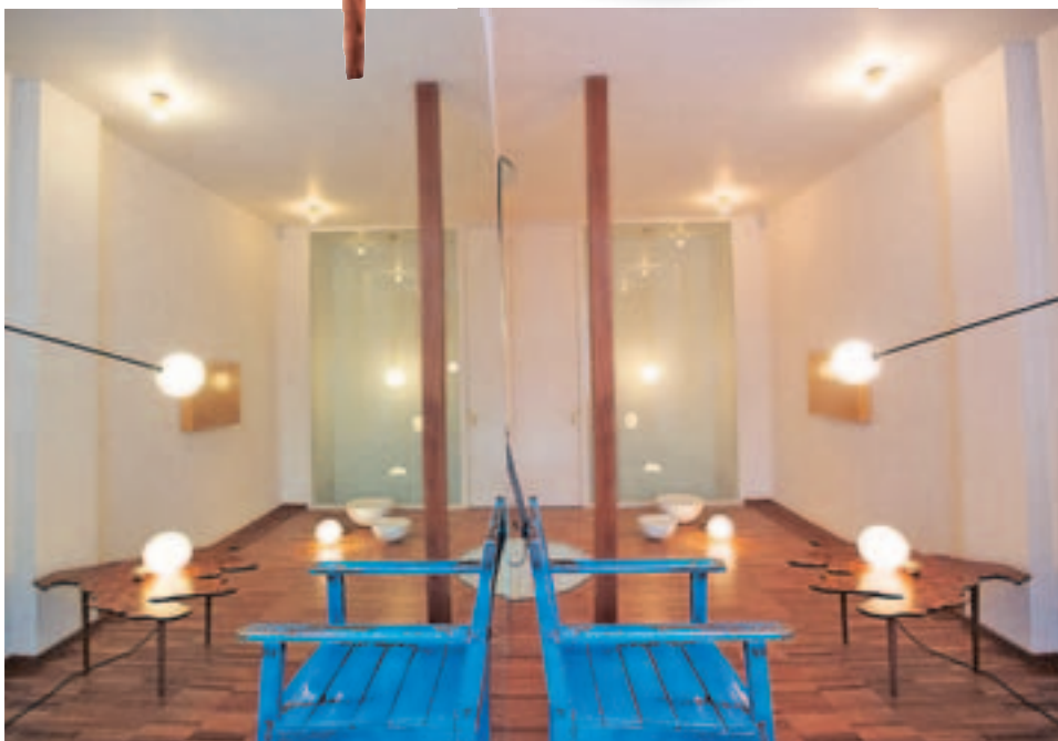
SHOW HOME The ground-floor gallery is a peaceful showcase for the designer's work. Seen here are a 'Kinetic' light (£13,500); ceiling-mounted 'Ball' lights (£562.50); 'Tip of the Tongue' table and floor lights (£650); 'Archipelago' table (around £1,660); and 'Meditation' stools (from £1,125).