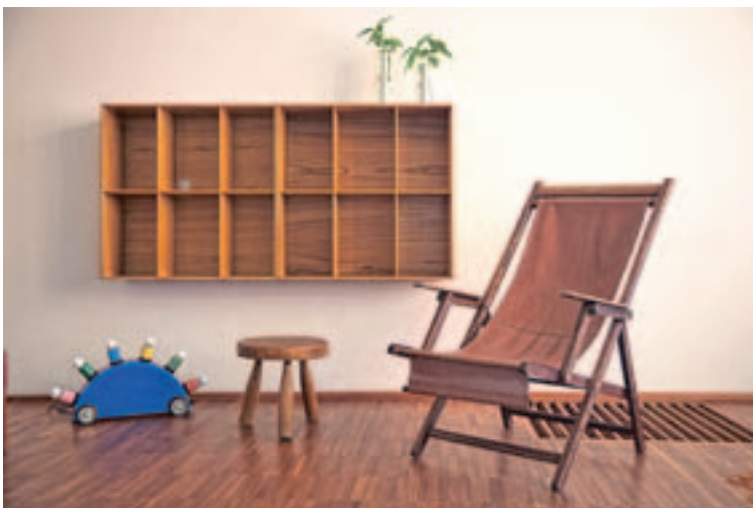
GOOD WOOD Another side of the meditation space, furnished simply with a vintage Danish rosewood bookcase, a milking stool and a leather/wood deck chair, designed by Mogens Koch for Studio Mumbai. A 1980s 'Super' lamp by Martine Bedin for Memphis adds a whimsical touch.