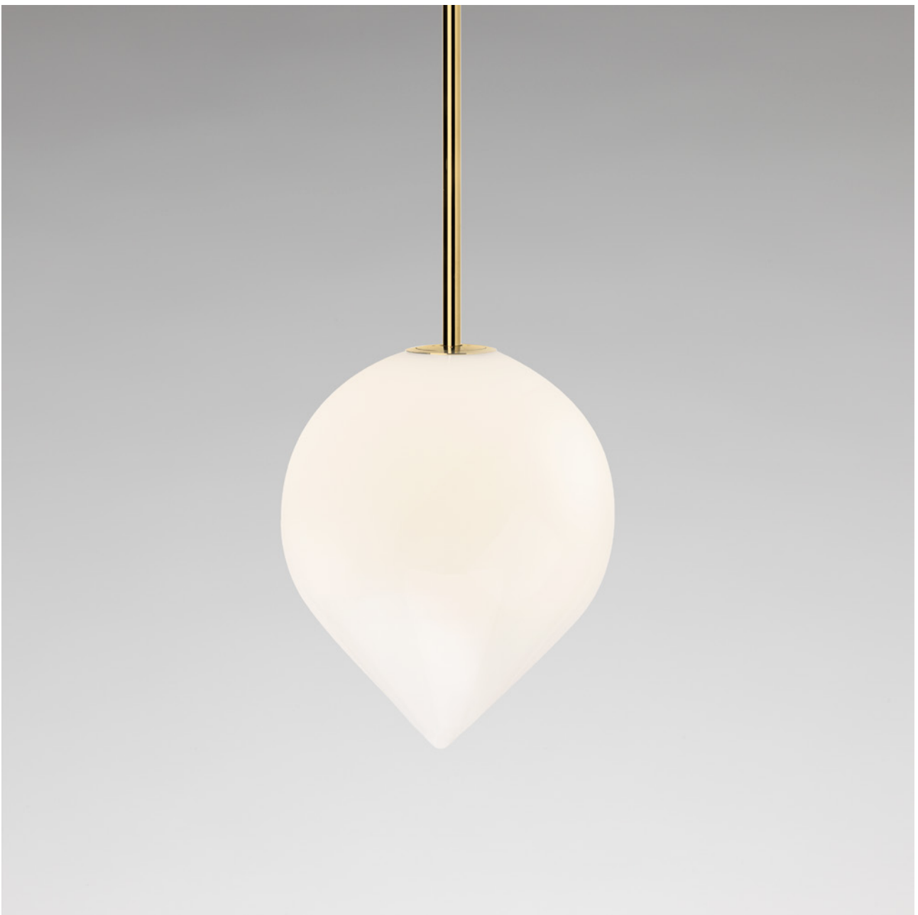
Bob Pendant, 2015