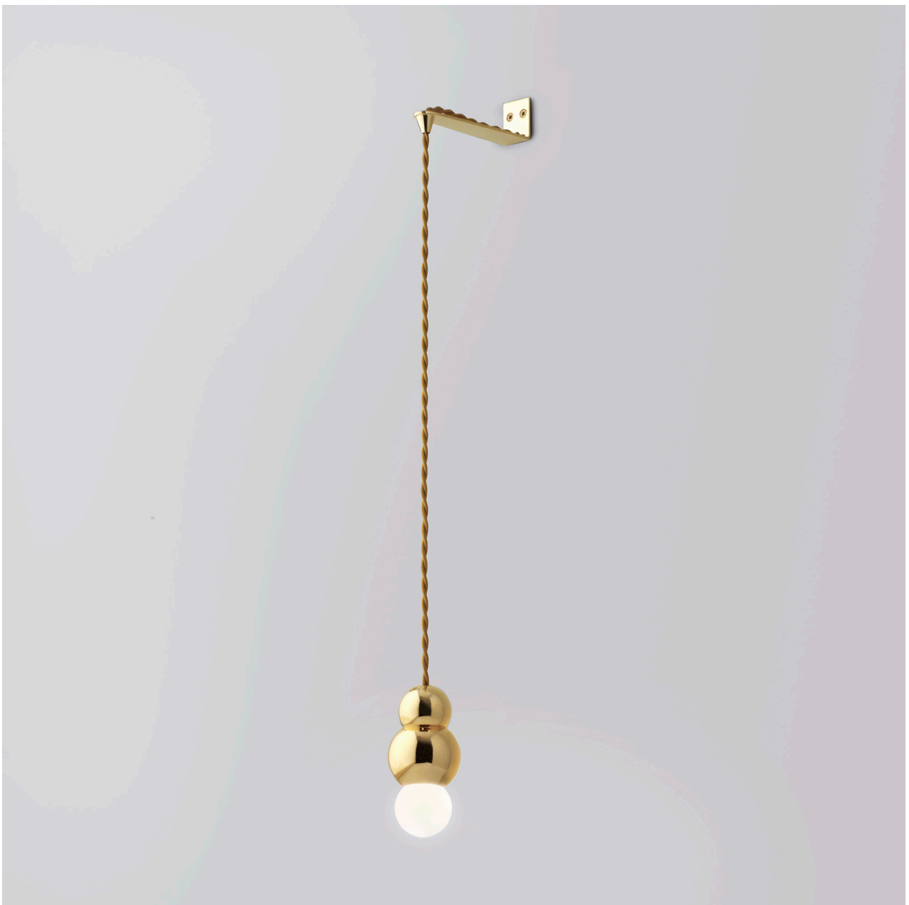
Ball Light Small Wall Bracket, 2008