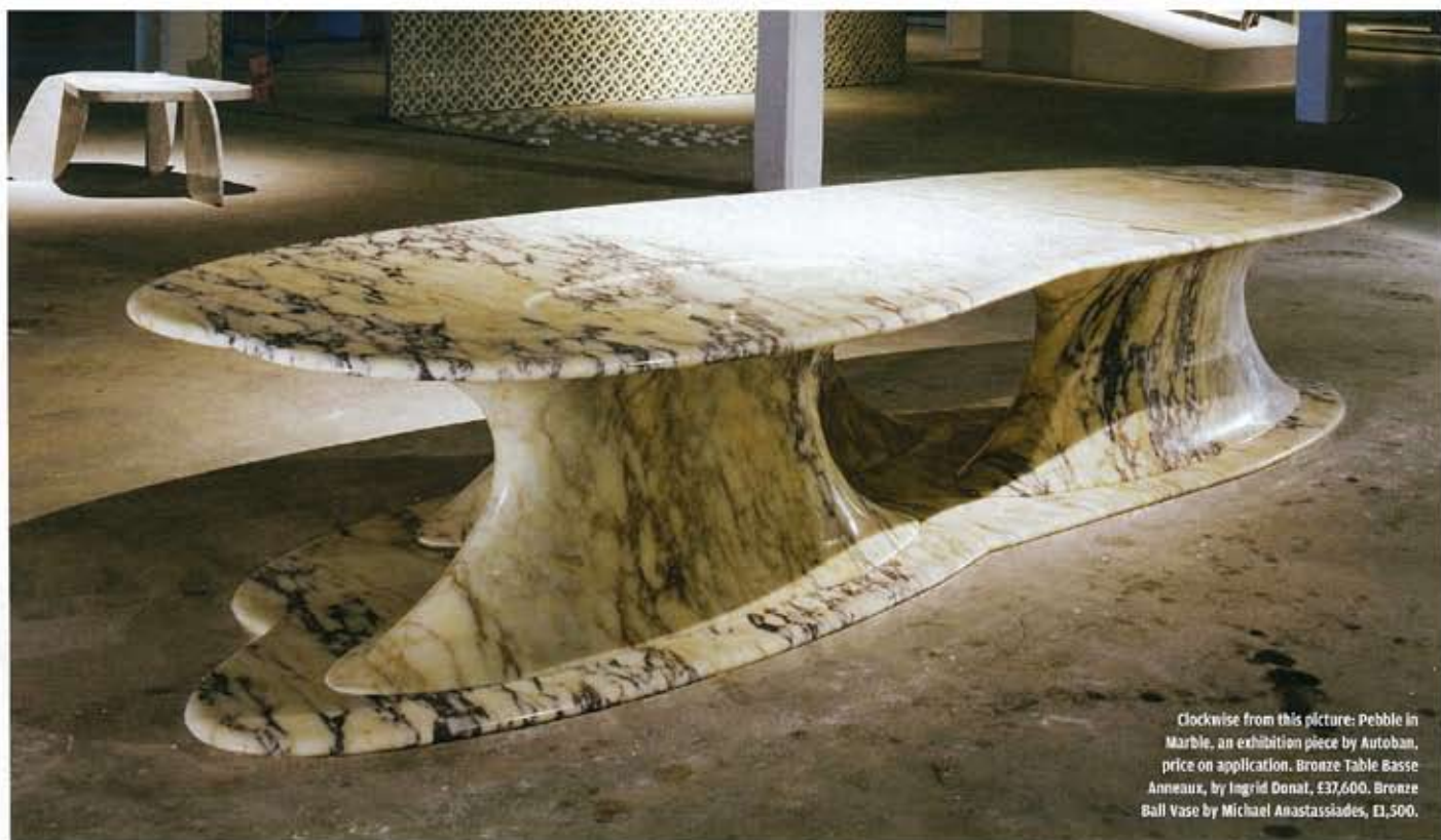
Clockwise from this picture: Pebble in Marble, an exhibition piece by Autoban, price on application. Bronze Table Basse Anneaux, by Ingrid Donat, £37,600. Bronze Ball Vase by Michael Anastassiades, £1,500.