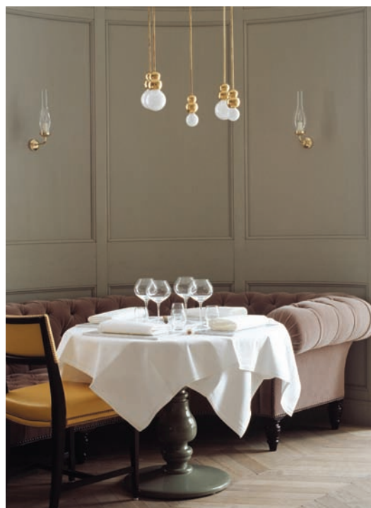
CLOCKWISE FROM LEFT: Anastassiades' Ball lights in the Ilse Crawford-designed Grand Hotel Stockholm; the Lit Lines series on show in the Palazzo Durini; the designer; the Tube Chandelier