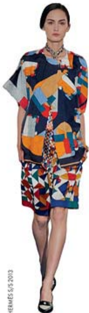
HERMES S/S 2013