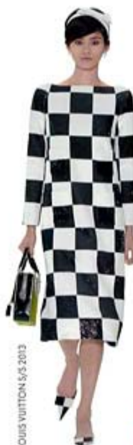
LOUIS VUITTON S/S 2013

“Estetico Quotidiano” collection by Seletti, price available upon request, Dimensione.