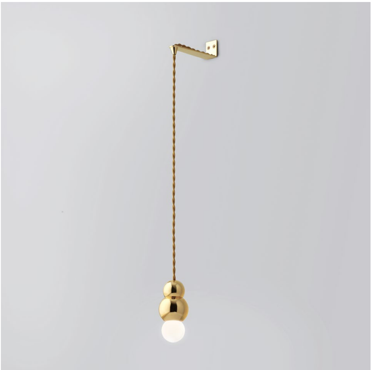
Ball Light Wall Bracket, 2008