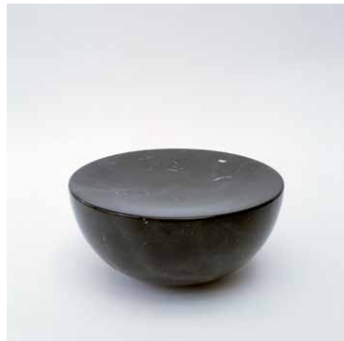
MEDITATION STOOL, 2006

Facing page: MICHAEL ANASTASSIADES The piece in the picture is called Shooting Star, from the exhibition Reload The Current Page, the artist's homecoming show in Cyprus.